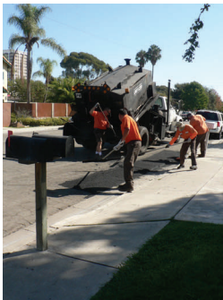
PHOTO: CITY OF COSTA MESA REPAIRS GAPING HOLES AS A CITY IMPROVEMENT PROJECT FOR CENTER